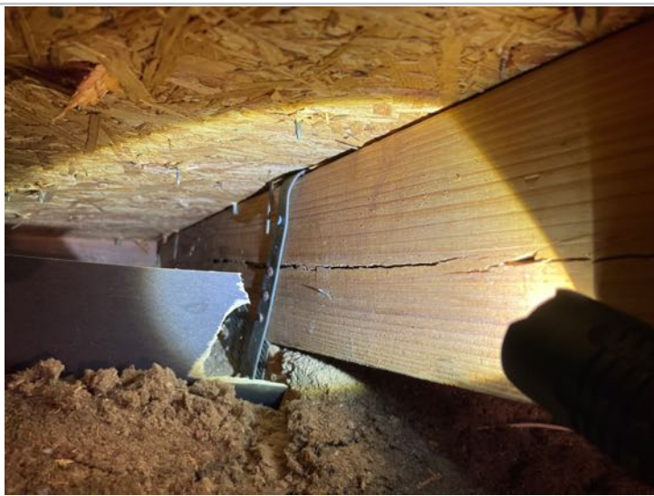
Strap- Anchor Side